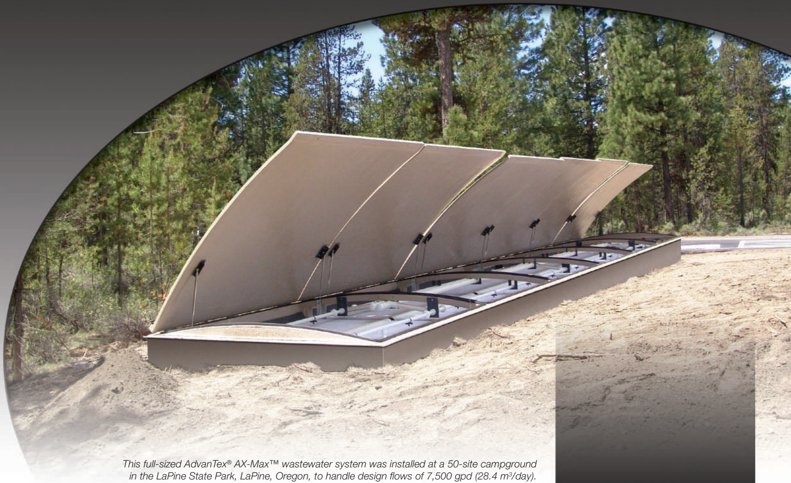
This full-sized AdvanTex® AX-Max™ wastewater system was installed at a 50-site campground in the LaPine State Park, LaPine, Oregon, to handle design flows of 7,500 gpd (28.4 m³/day).