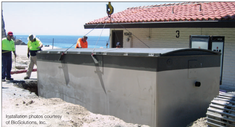
Installation photos courtesy of BioSolutions, Inc.