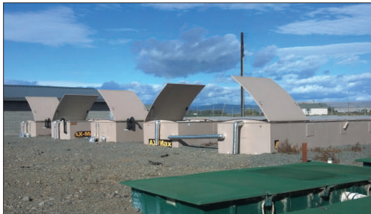
The Yakama Nations Housing Authority in Washington state added five AdvanTex® AX-Max units (background) to its ten AdvanTex AX-100 units, increasing the capacity of its wastewater system by 50%.

Orenco's newest product in the AdvanTex line is the AX-Max™: a completely-integrated, fully-plumbed, and compact wastewater treatment plant that's ideal for commercial properties and communities. It's also ideal for projects with strict discharge limits, limited budgets, and part-time operators.